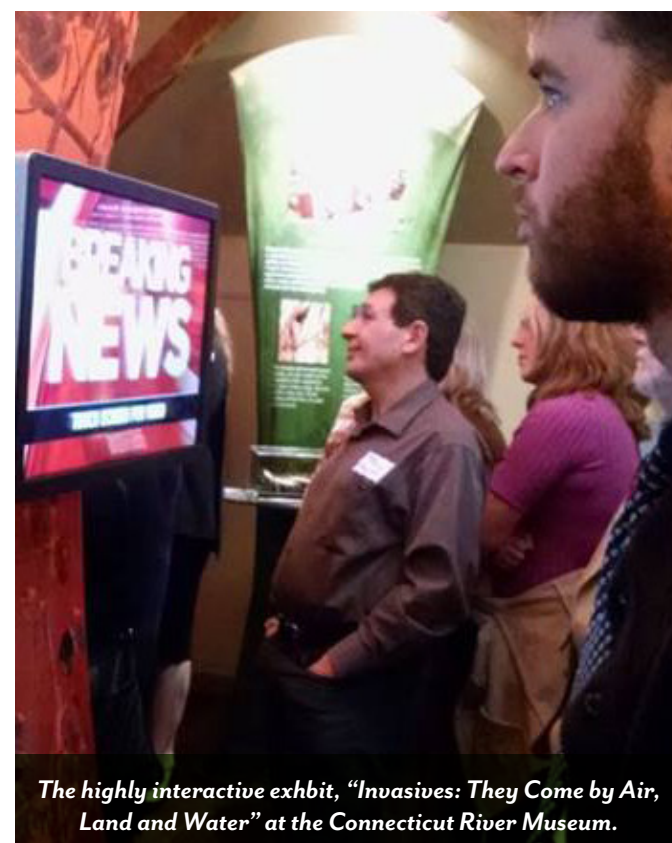
The highly interactive exhibit, "Invasives: They Come by Air, Land and Water" at the Connecticut River Museum.