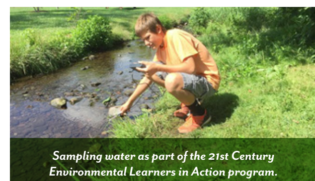
Sampling water as part of the 21st Century Environmental Learners in Action program.

With guidance and assistance from the CT Invasive Plant Working Group, the CRCCD produced a full color, expanded edition of Invasive Plants in Your Backyard! A Guide to Their Identification and Control . The guide includes nine additional plants and helps build awareness of the detrimental impacts of invasive plants on natural habitats and provides landowners with tools and information to protect and enhance the natural resources on their properties. CRCCD printed 12,500 copies of the guide for distribution throughout the region and posted an electronic version on their website.