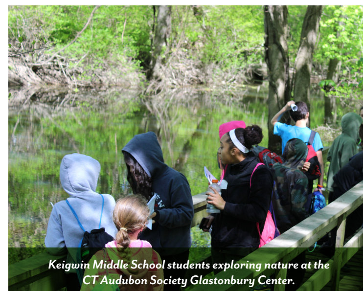
Keigwin Middle School students exploring nature at the CT Audubon Society Glastonbury Center.