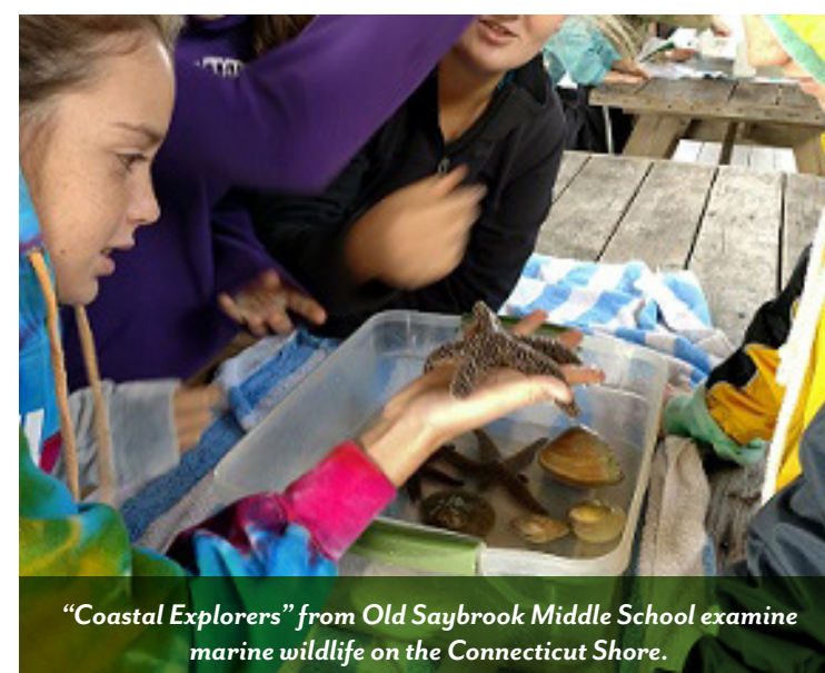
"Coastal Explorers" from Old Saybrook Middle School examine marine wildlife on the Connecticut Shore.