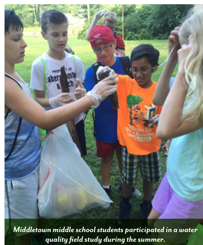
Middletown middle school students participated in a water quality field study during the summer.