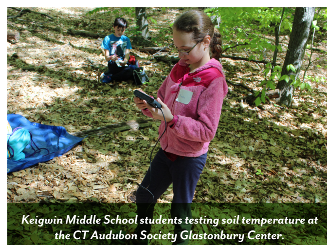
Keigwin Middle School students testing soil temperature at the CT Audubon Society Glastonbury Center.