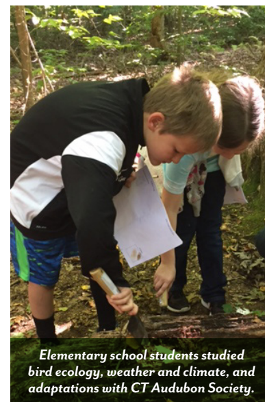
Elementary school students studied bird ecology, weather and climate, and adaptations with CT Audubon Society.

We are so pleased to present to you the latest edition of The Rockfall Chronicle!